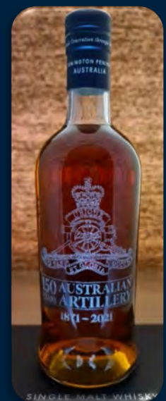
RAA 150th Whisky Bottle (Option 3)