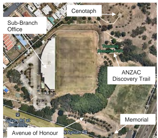
Toowong Memorial Park